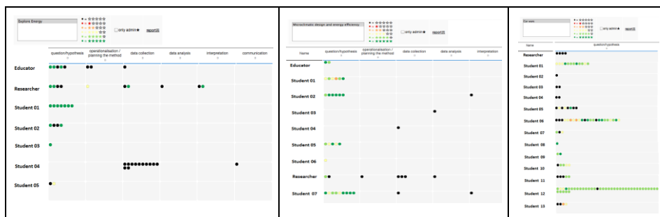
Figure 2 weSPOT learning analytics dashboard for the three groups.

Educators used weSPOT analytics dashboard (Fig.2) to observe participation and provide feedback during a face-to-face session. Groups used different devices: computers, laptops, iOS/Android phones and tablets. They listed various benefits of PLEs: 1. Peers interactions with ratings and comments supporting reflection (Question), 2. Learn from each other with data collection and discussion (nQuire-it). 3. Visualising “pros and cons” on controversial issues (mind maps). 4. Forming opinions (Report). Educators used the weSPOT analytics dashboard to observe participation and provide feedback during the face-to-face session (Fig. 2). Groups used desktop computers, laptops, iOS phones/tablets and Android phones and tablets during their lesson.