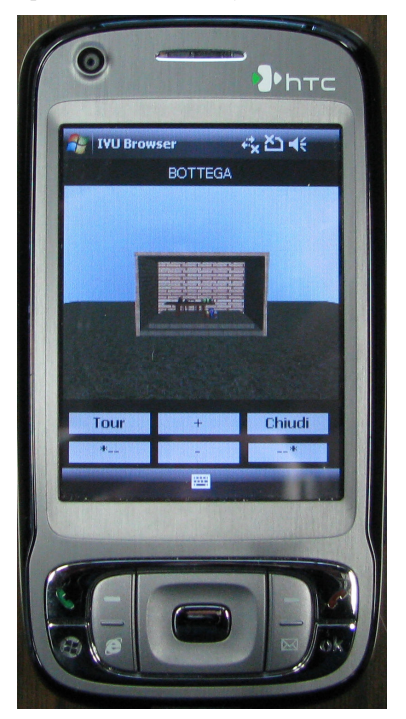
Figure 4. The 3D reconstruction of the "bottega" where wine is sold

After completing each mission, the group receives "Gods' gift", i.e. the 3D reconstruction of the place correctly identified (Figure 4). The students have the chance to interact with the 3D reconstructions on the phone and visually compare the possible ancient look with the existing remains. The proposed 3D models are scientifically correct, having been designed in collaboration with archaeologists of the Ancient History Department at the University of Bari, who are carrying out research projects on archaeological parks in Southern Italy.