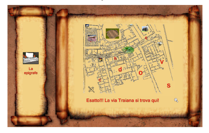
Figure 5. Among the reflection activities proposed by the Master Application during the debriefing phase, students must place the image of the site elements (left) on the right positions on the map of the park

After the game, students participate in the debriefing phase, in which the knowledge which they have implicitly learned during the game is reviewed and shared. During the debriefing phase, using the Master Application, the game master (i.e a teacher) and students play a "collective memory game" where monuments and archaeological objects (previously observed by students as part of the game) are to be placed in the "right" place on the park map (Figure 5). The Master Application permits to show the 3D reconstructions of the historical monuments in a much higher definition than those on the cell phone.