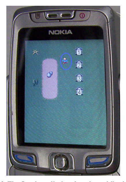
Figure 3. The Oracle as displayed on the mobile phone: as Gaius approaches one of the six temples, he receives textual hints to find the associated site

After completing each mission, the group receives "Gods' gift", i.e. the 3D reconstruction of the place correctly identified (Figure 4). The students have the chance to interact with the 3D reconstructions on the phone and visually compare the possible ancient look with the existing remains. The proposed 3D models are scientifically correct, having been designed in collaboration with archaeologists of the Ancient History Department at the University of Bari, who are carrying out research projects on archaeological parks in Southern Italy.