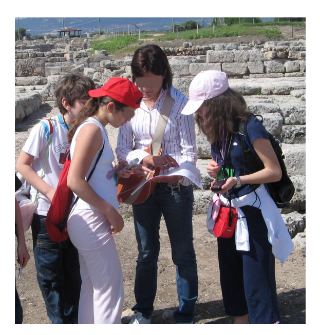
Figure 1. A group performing the game in the Egnathia archeological park. The student on the right carries the first mobile phone with the Game Application, which provides information about the places to locate and a backpack with the loudspeakers, the next student holds the paper map, and the third student from the left holds the second mobile phone with the Hint Application displaying the Oracle

The student group performs each mission following some indications provided on the first mobile phone running the Game Application (Figure 2).