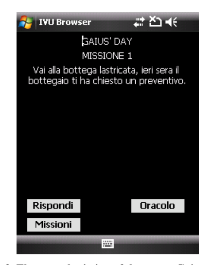
Figure 2. The second mission of the game: Gaius must go the "bottega" (screenshot taken from an HTC TyTN II running Explore!)

Figure 1. A group performing the game in the Egnathia archeological park. The student on the right carries the first mobile phone with the Game Application, which provides information about the places to locate and a backpack with the loudspeakers, the next student holds the paper map, and the third student from the left holds the second mobile phone with the Hint Application displaying the Oracle