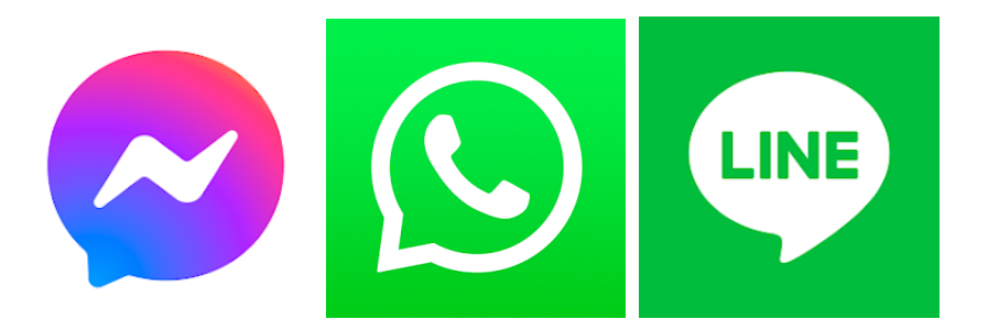
Fig. 4. Messenger© [46] application icon (left) seems more refined, Whatsapp© [35] application icon (center) is a little simpler, and Line© [50] application icon (right) is the most basic of the three.

Despite the inherent added value of visual complexity, an optimal visual design should also strive for the type of minimalism in which each visual element has a purpose. This quality can be evaluated by the propositional density of an icon, which is based on the number of deep propositions it has relative to the number of its surface propositions. As mentioned earlier, deep propositions are the underlying meanings of elements, whereas surface propositions are the perceivable elements of a design. The higher this density, the more interesting a design would seem to be [34]. While this concept is often applied to logo design, it is also equally applicable to icon design. Balancing the number of surface propositions and visual details is an important consideration in icon design. During the assurance phase, in particular, moderate levels of complexity with an appropriate level of propositional density can have more positive effects than during first exposure.