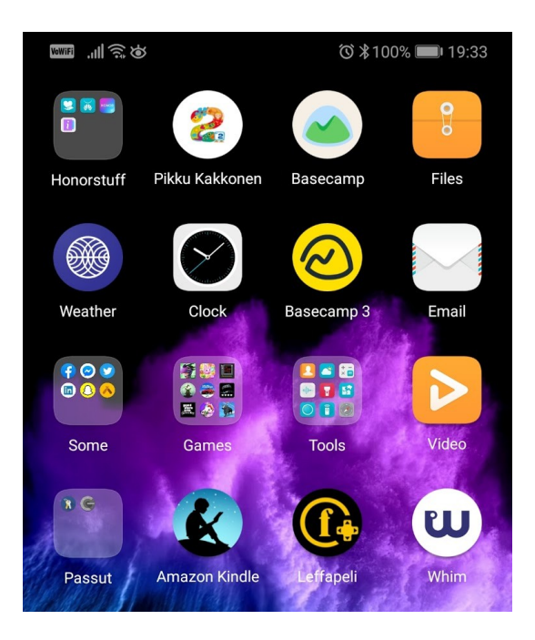
Fig. 9. The original (top row) and the latest (second row from top) versions of the Basecamp© [25] icon on the home screen of a mobile device.

The black and yellow icon is very simple, even compared to the two previous versions. The simplicity of its design, in combination with its strong color contrasts, improve the usability performance of this icon during first exposure, making it more likely to stand out among other visually competing application icons. Its choice of colors is also likely to assist with the continued use of the application by providing strong and simple visual cues that can be biased for – e.g., while looking for the application on the user's device home screen. For example, Figure 9 shows the effectiveness of this version of the icon in comparison to the original version on the home screen of a mobile device. The new design clearly also works more effectively as a small-sized icon.