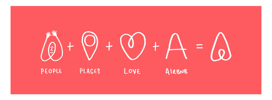
Fig. 11. The four elements of the Airbnb© [26] Bélo symbol [63].

being that the company name is usually present in the logo along with the visual "Bélo" symbol, whereas in the application icon the symbol stands alone, and the name of the application is in the text label which is dependent on the mobile device platform. The aim of the new design has been to transcend language and create "a simple icon that could be drawn by anyone, worked across every touchpoint, and became a symbol of belonging." [63]. The "Bélo" symbol is made up of four individual elements: people, places, love, and the letter "A" for Airbnb© [26] (see Figure 11). The dominating and traditional blue color in the original company logo and application icon has been replaced with a trendy coral-pink color in the new design.