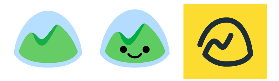
Fig. 8. The original Basecamp© icon (left), first redesign in 2014 (center), and second redesign in 2019 (right).

Also as previously discussed, familiarity and congruence may have a lesser role to play during first exposure – being mostly limited to supporting the positive effects of cognitive processing, by incorporating visual elements that represent familiar meanings through symbolism or metaphor. The imagery of the original icon is not clearly connected with the functionality of the application – i.e., project management – and does not utilize congruence in this fashion. By its nature, the Basecamp© [25] mobile application is an extension of its online project management tool, and therefore, first exposure to the tool is more likely to happen online in a web browser environment, rather than in a mobile application marketplace. Familiarity in this regard is manifested in the unmodified repetition of the software logo in the mobile application icon, which also ensures rapid recognition of the associated software tool during the assurance phase and continued use.