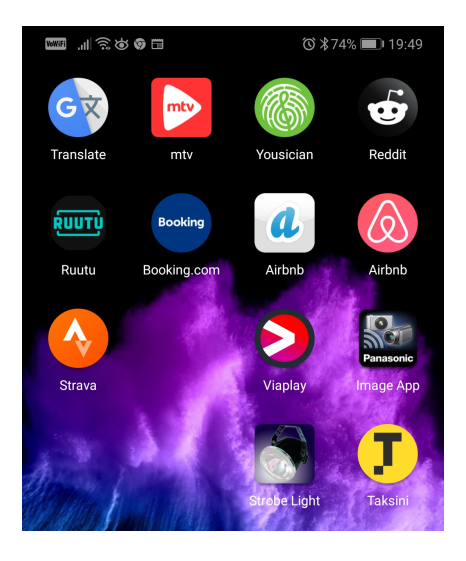
Fig. 12. The original (second row from top), and new Airbnb© [26] icons on the home screen of a mobile device.