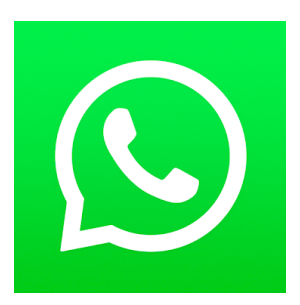
Fig. 1. Whatsapp© [35] application icon with propositional density of 1.

However, simplicity versus complexity can be discussed at different levels. At the most primitive level, comparisons can be made in performance between targets and distractors that are either differentiated by a single visual property – e.g., a pink rectangle target, with brown and purple rectangles as distractors – or a conjunction of properties – e.g., a pink rectangle target, with brown and purple triangles as distractors [32, 33]. On a slightly higher level of abstraction, complexity can be considered as the number of surface propositions – i.e., perceivable elements of a design – which is a factor in measuring a design's propositional density [34]. Consider the Whatsapp© [35] icon shown in Figure 1. In this icon, there are two surface propositions: a speech bubble, and an old fashion telephone handle. In this case, the relevant deep propositions would be conversations and telephone calls. Therefore, the propositional density of this particular icon is 2/2, which equals one. Propositional densities of logos and icons can be higher, with values up to three and beyond. In the best case scenarios the propositional density of an icon should not be less than one – that is, there should be no visual elements that do not relay a meaning.