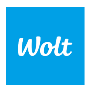
Fig. 3. Foodora© [48] application icon (left) is more concrete than the Wolt© [49] application icon (right).